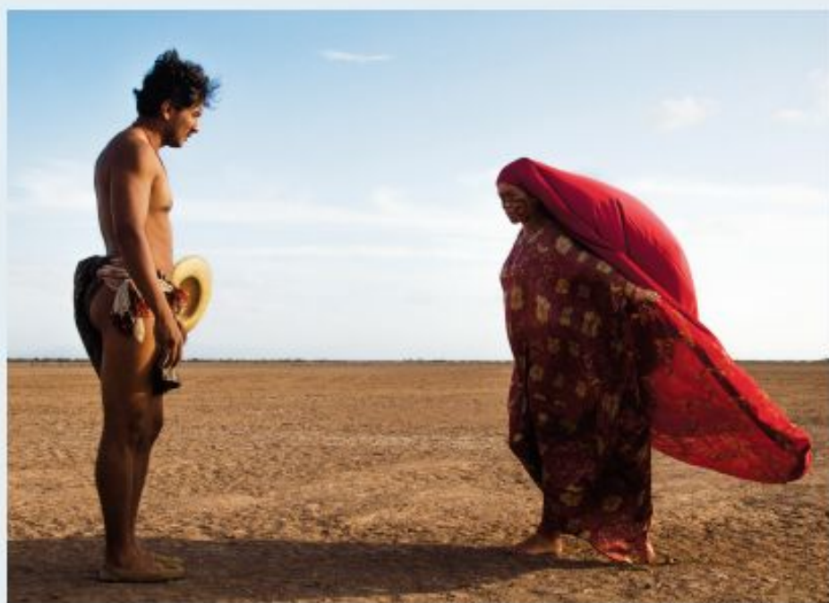
For the 'Birds' Cristina Gallego, who co-directed the 2018 Colombian drama "Birds of Passage" will take part in this year's Careyes Creation Lab.