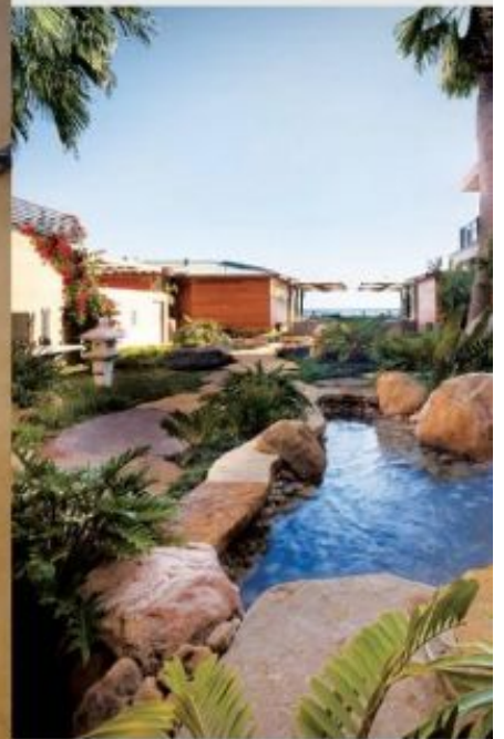
Left to right: A minimalist bath at NOBU RYOKAN MALIBU: JAPANESE-INSPIRED GARDENS ; rooms overlooking CARBON BEACH .