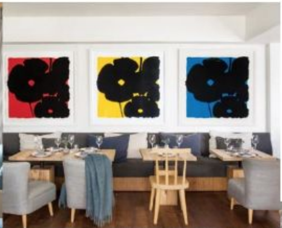
Left to right: Hues of the sand and sea at the MALIBU BEACH INN ; the dining room; the TERRACE overlooking the Pacific.